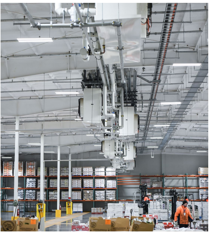
The newly built cold storage and distribution center in Western Sydney.

Compared to a traditional ammonia-pumped circulation system, the two NewTon R6000 units for the frozen storage area reduce the amount of ammonia from an estimated 1,900kg (4,189lbs) to 100kg (220lbs), according to Peter O'Neill, General Sales Manager for Mayekawa Australia, who spoke about the project during ATMOsphere Australia, held this past May in Melbourne. The CO<sub>2</sub> charge in this case is 1,300kg (2,866lbs).